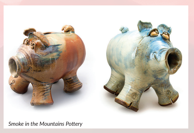
Smoke in the Mountains Pottery