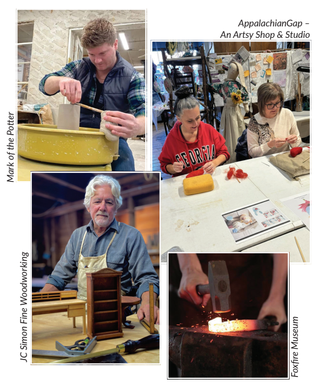
AppalachianGap - An Artsy Shop & Studio Mark of the Potter JC Simon Fine Woodworking Foxfire Museum