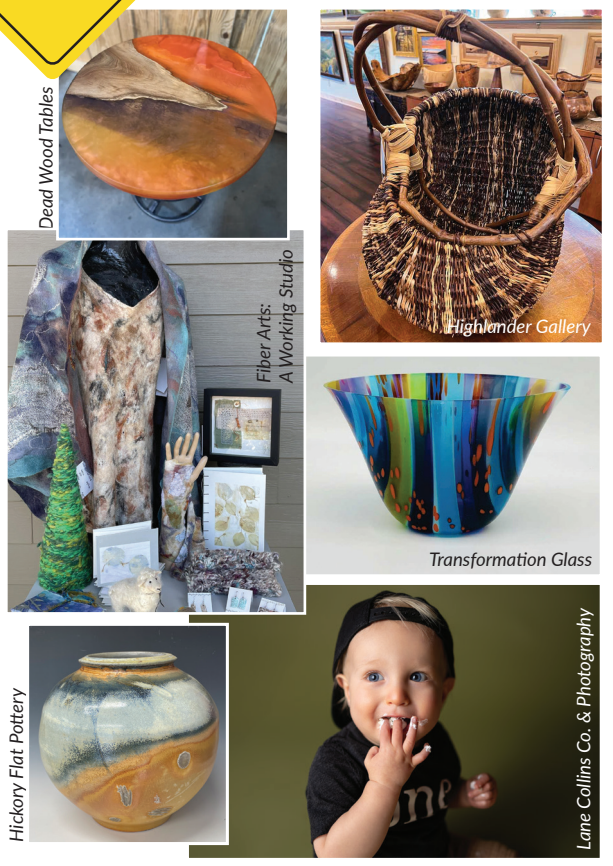
Dead Wood Tables Highlander Gallery Fiber Arts: A Working Studio Transformation Glass Hickory Flat Pottery Lane Collins Co. & Photography