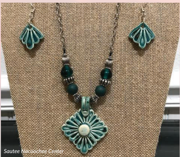
Sautee Nacoochee Center

W2 Sautee Nacoochee Center / Folk Pottery Museum of Northeast Georgia *+ 283 Highway 255 North, Sautee-Nacoochee, GA Cultural community center, 45th year, 1927 schoolhouse, three galleries, art studio, theater, history museum, historic gymnasium, slave cabin, blacksmith shed, community hall, outdoor stage, children's playground, + John Burrison Pottery Studio. Mon-Sat 10-5; Sun 1-5. 706-878-3300 folkpotterymuseum.com / scna.org