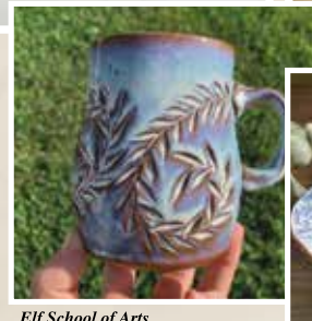
Elf School of Arts