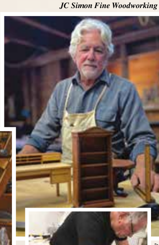
JC Simon Fine Woodworking