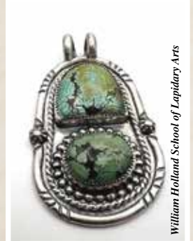
William Holland School of Lapidary Arts