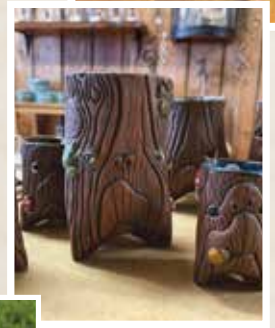
Well Made Dahlonaga