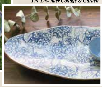
The Lavender Cottage & Garden