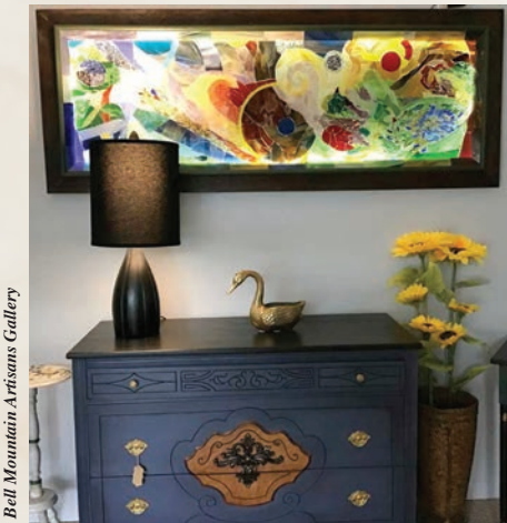
Bell Mountain Artisans Gallery