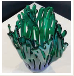
Time to Fuse

Please use this map to discover ART year round! Just a short drive from Atlanta, Athens, Greenville, and Asheville. For more information about the tour, the artists, special events, art happenings, and more visit ArtsTour.org .