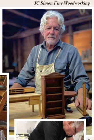
JC Simon Fine Woodworking