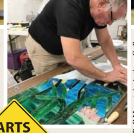
Bell Mountain Artisan Gallery