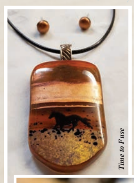
Time to Fuse