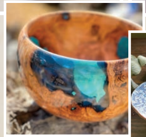
Artistry in Epoxy