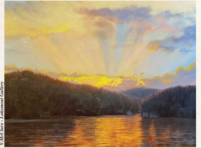
Y. McClure - Lakemont Gallery

JOIN US IN 2023 FOR Two ARTS Tour Events June 9, 10, 11 and November 3, 4, 5 10am - 5pm Everyday