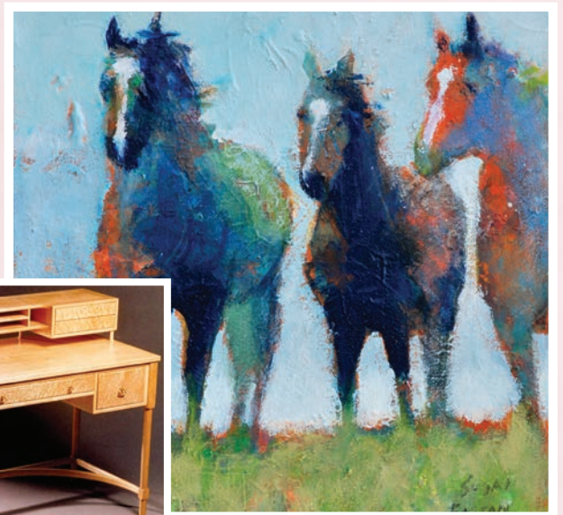
Timpson Creek Gallery