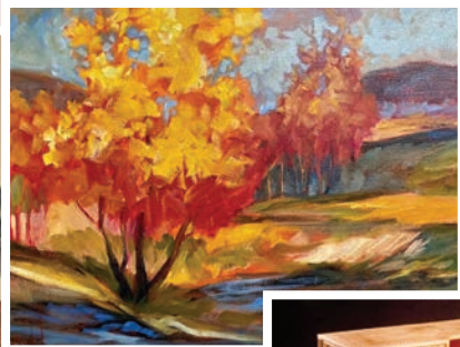
Hemlock Studio Gallery