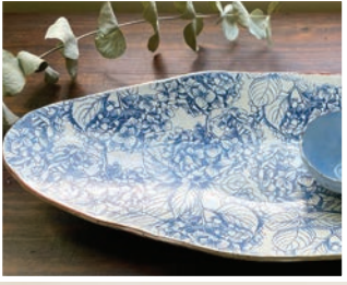
The Lavender Cottage & Garden